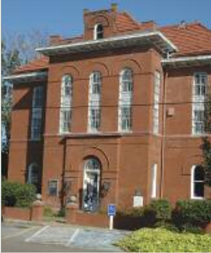
The Noxubee County Library in Macon.

MSU in Noxubee County: Noxubee County Extension Office 2107 E. Adams Street Macon, MS 39341 Email: noxubee@ext.msstate.edu