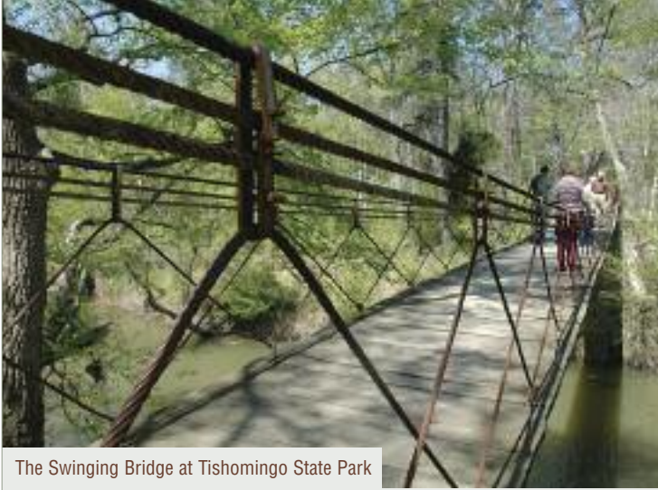
The Swinging Bridge at Tishomingo State Park