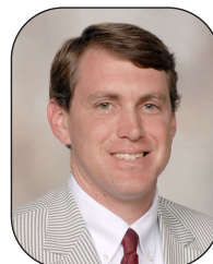
Sumner Davis Leader Extension Center for Government & Community Development