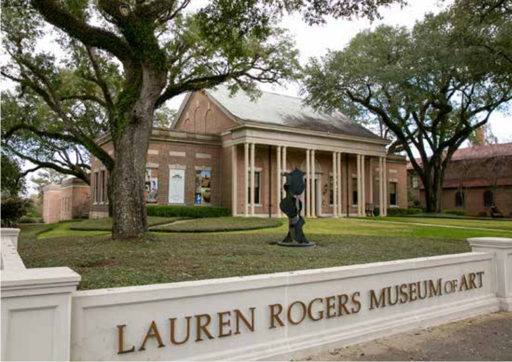
The Lauren Rogers Museum of Art in Laurel was opened in 1923 as a memorial to Lauren Eastman Rogers, the only son of one of the town’s founding families, who died in 1921 at the age of 23.