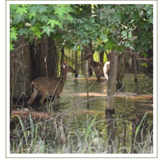
Data show that deer do not fare well in flood years, but they tend to fare better than usual 1 year later.

Since the Mississippi River drains about 40 percent of the North American continent, significant landuse changes over the last decades have contributed to more water being funneled downstream. More water entering the river, along with levees that keep it from flooding cities and other areas, result in many days when the batture is flooded.