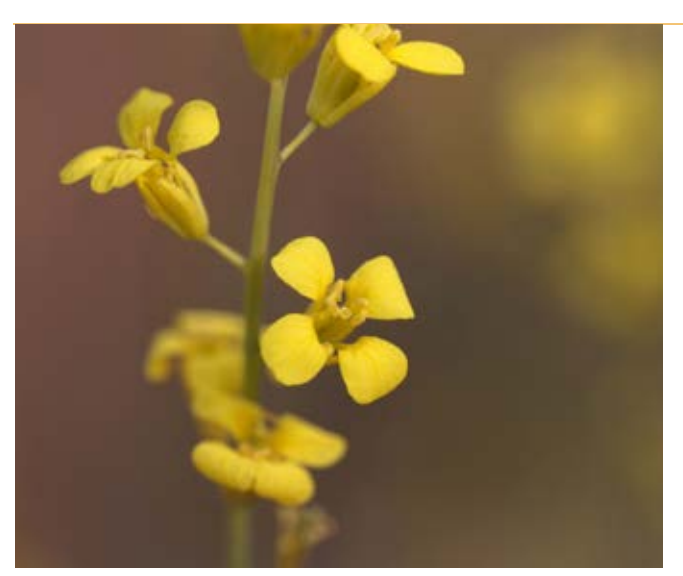
Brassica carinata flowers

A n oilseed that can be turned into jet fuel with almost no processing is being examined as a well-timed winter cover crop for Mississippi fields.